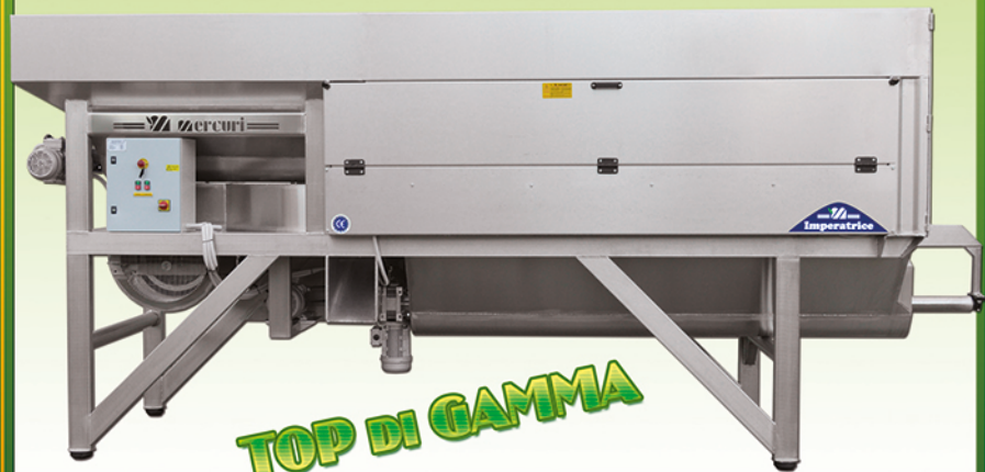
Sorter machine: IMPERATRICE AUTOPULENTE